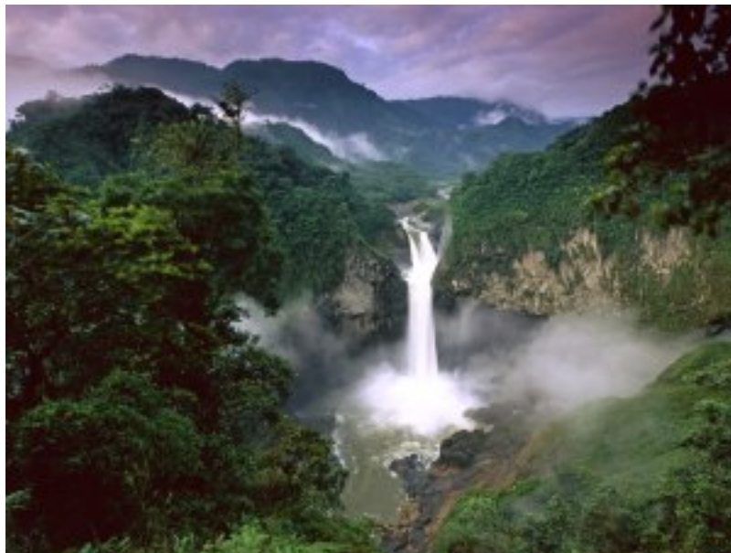
San Rafael falls in Yasuní National Park

In 2007, the Ecuadorian government of President Raffael Correa Delgado started an initiative to save the rain forest in the Yasuni National Park and to respect the indigenous population in that area: the so called Yasuní-Ishpingo-Tambococha-Tiputini (ITT) Initiative. President Correa proposed to refrain indefinitely from exploiting the oil reserves of the ITT oil field in the Yasuní National Park. In exchange the international community should pay for 50 percent of the value of the reserves.